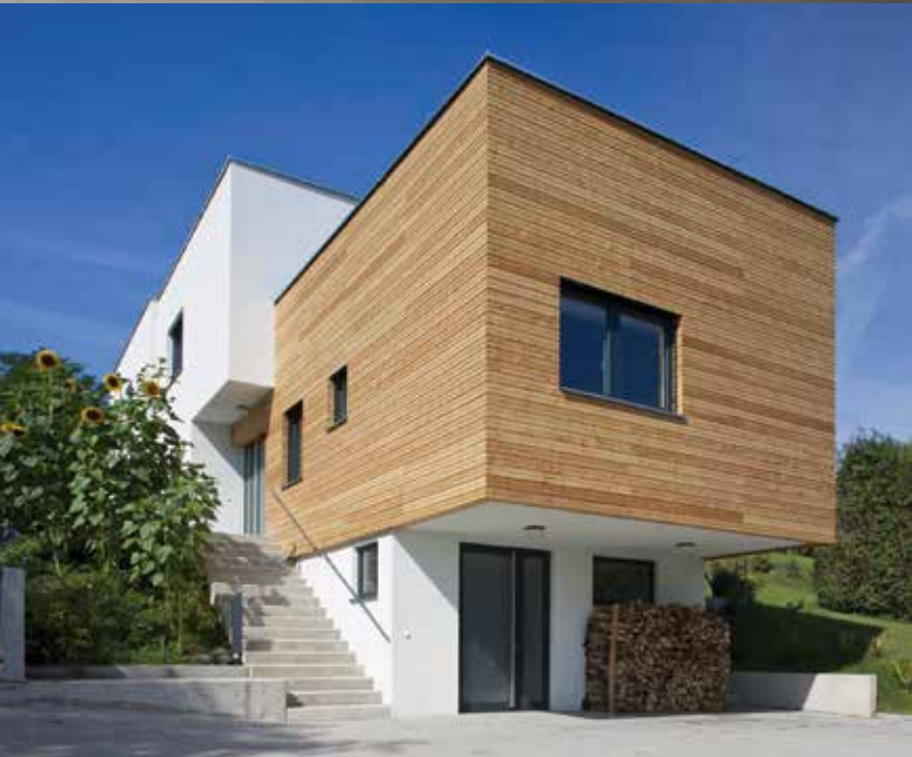
Architektur, C&H